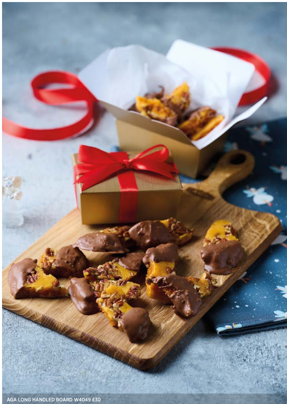
AGA LONG HANDLED BOARD W4049 £30