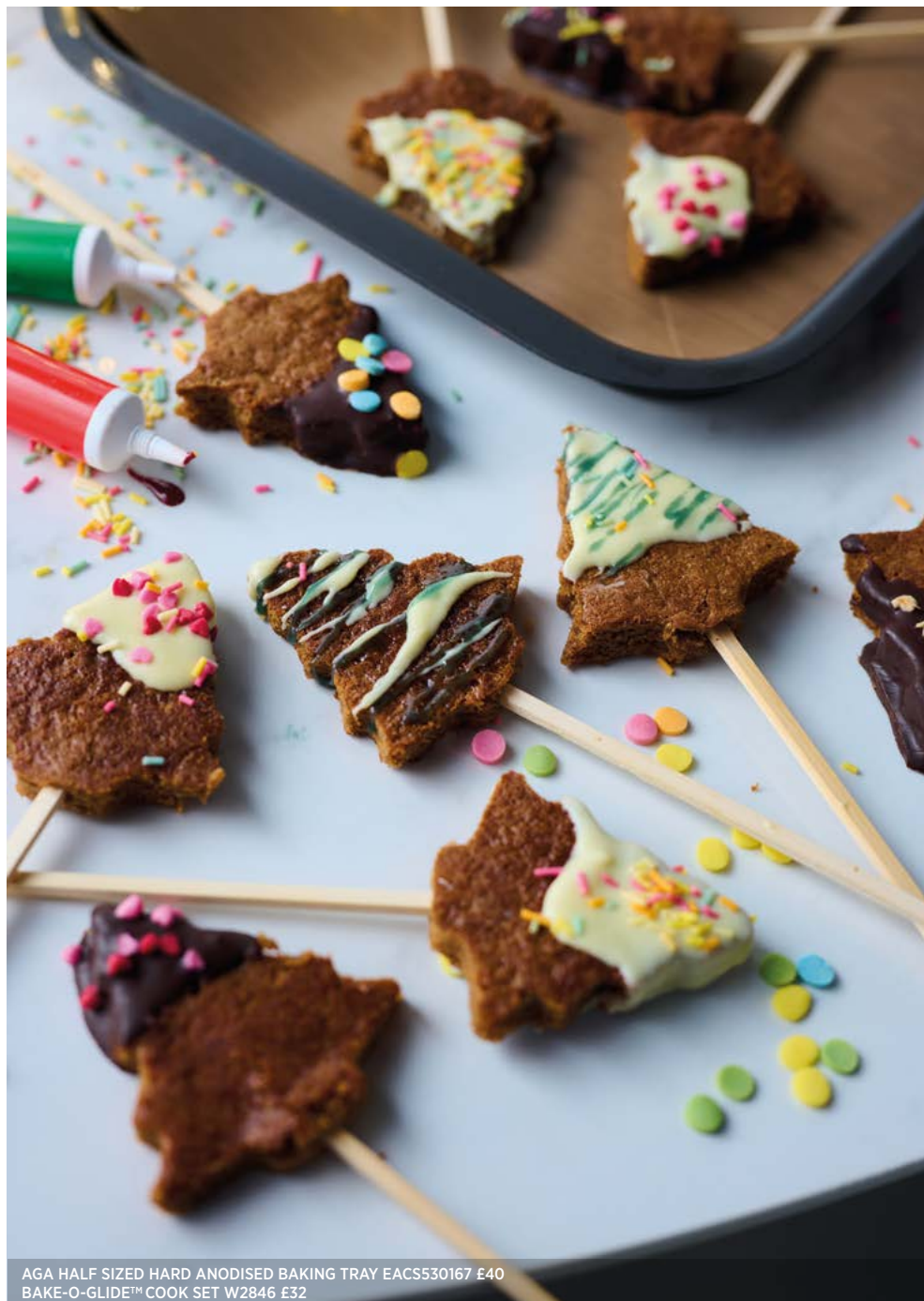
AGA HALF SIZED HARD ANODISED BAKING TRAY EAC5530167 £40 BAKE-O-GLIDE™ COOK SET W2846 £32