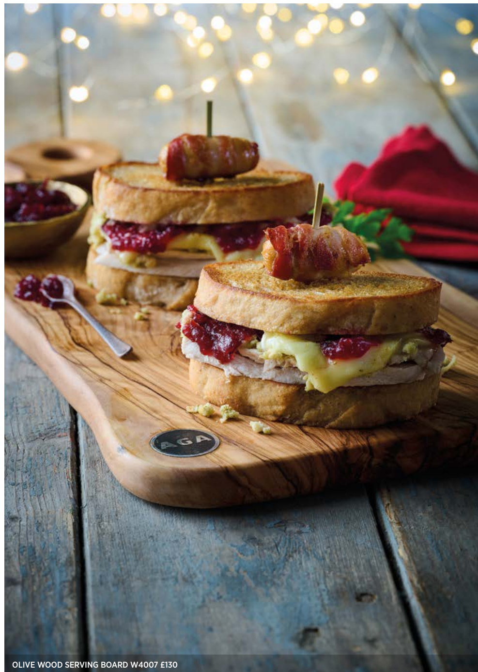
OLIVE WOOD SERVING BOARD W4007 £130