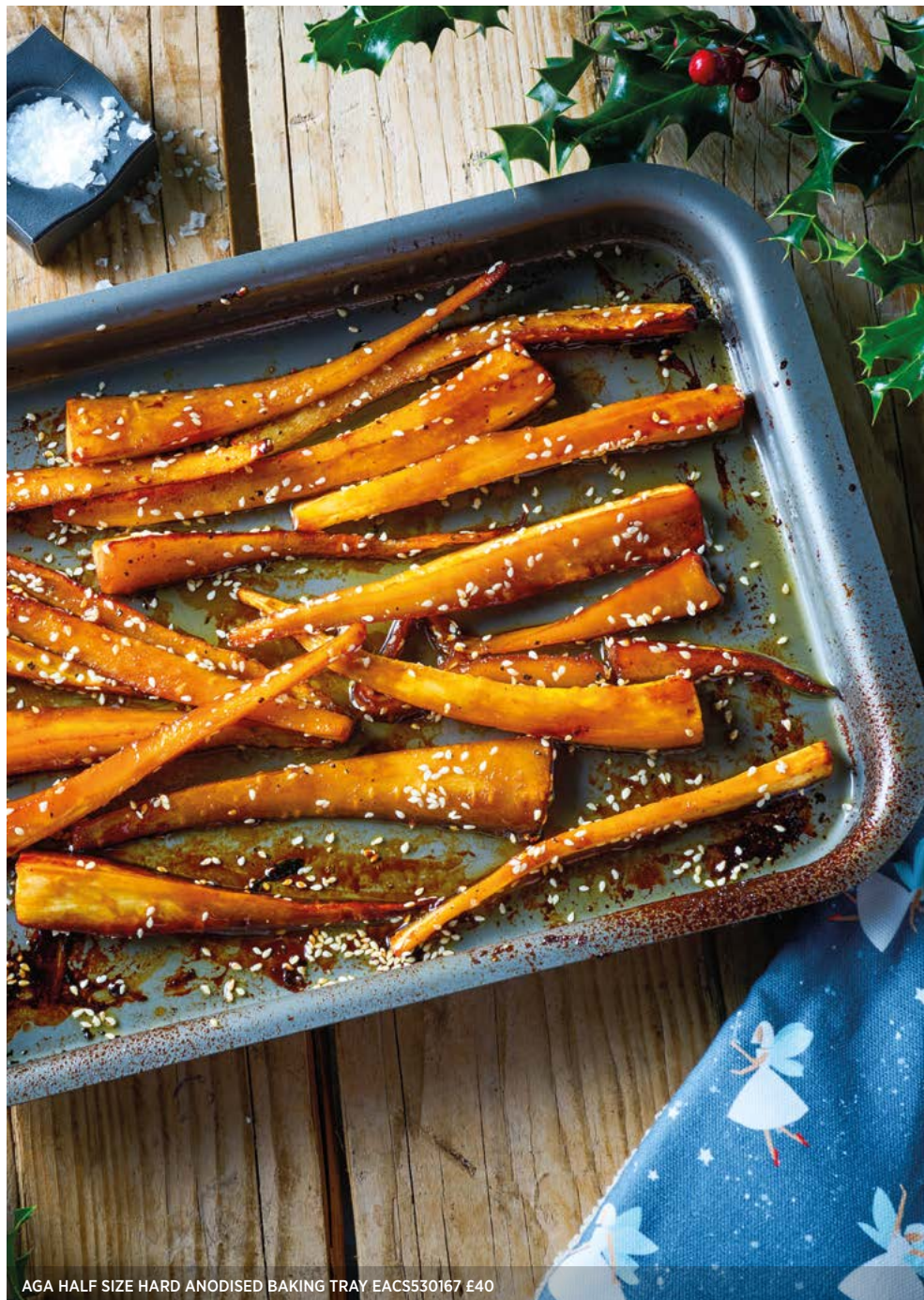
AGA HALF SIZE HARD ANODISED BAKING TRAY EACS530167 E40