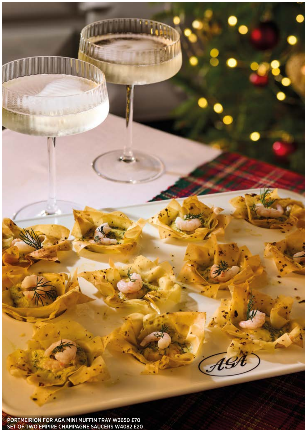
PORTMEIRION FOR AGA MINI MUFFIN TRAY W3650 £70 SET OF TWO EMPIRE CHAMPAGNE SAUCERS W4082 £20