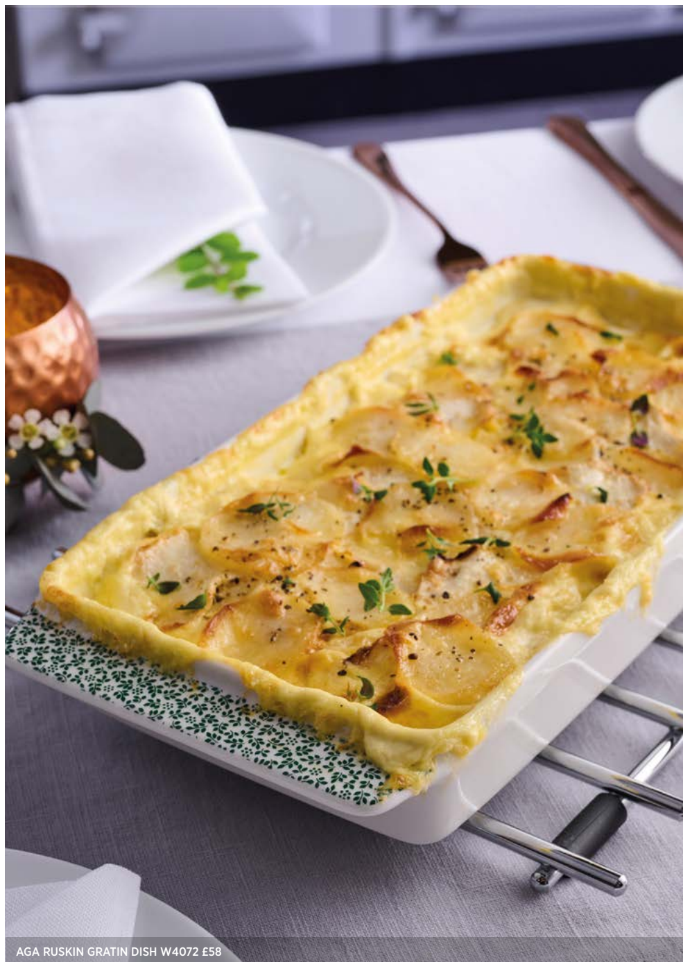
AGA RUSKIN GRATIN DISH W4072 £58