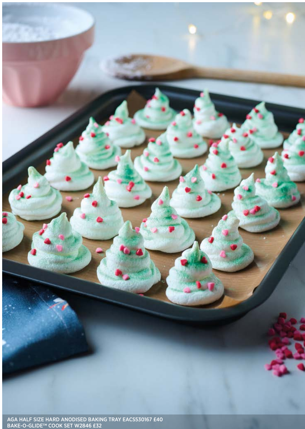
AGA HALF SIZE HARD ANODISED BAKING TRAY EACS530167 £40 BAKE-O-GLIDE™ COOK SET W2846 £32