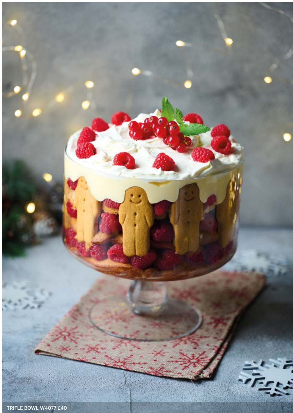
TRIFLE BOWL W4077 £40