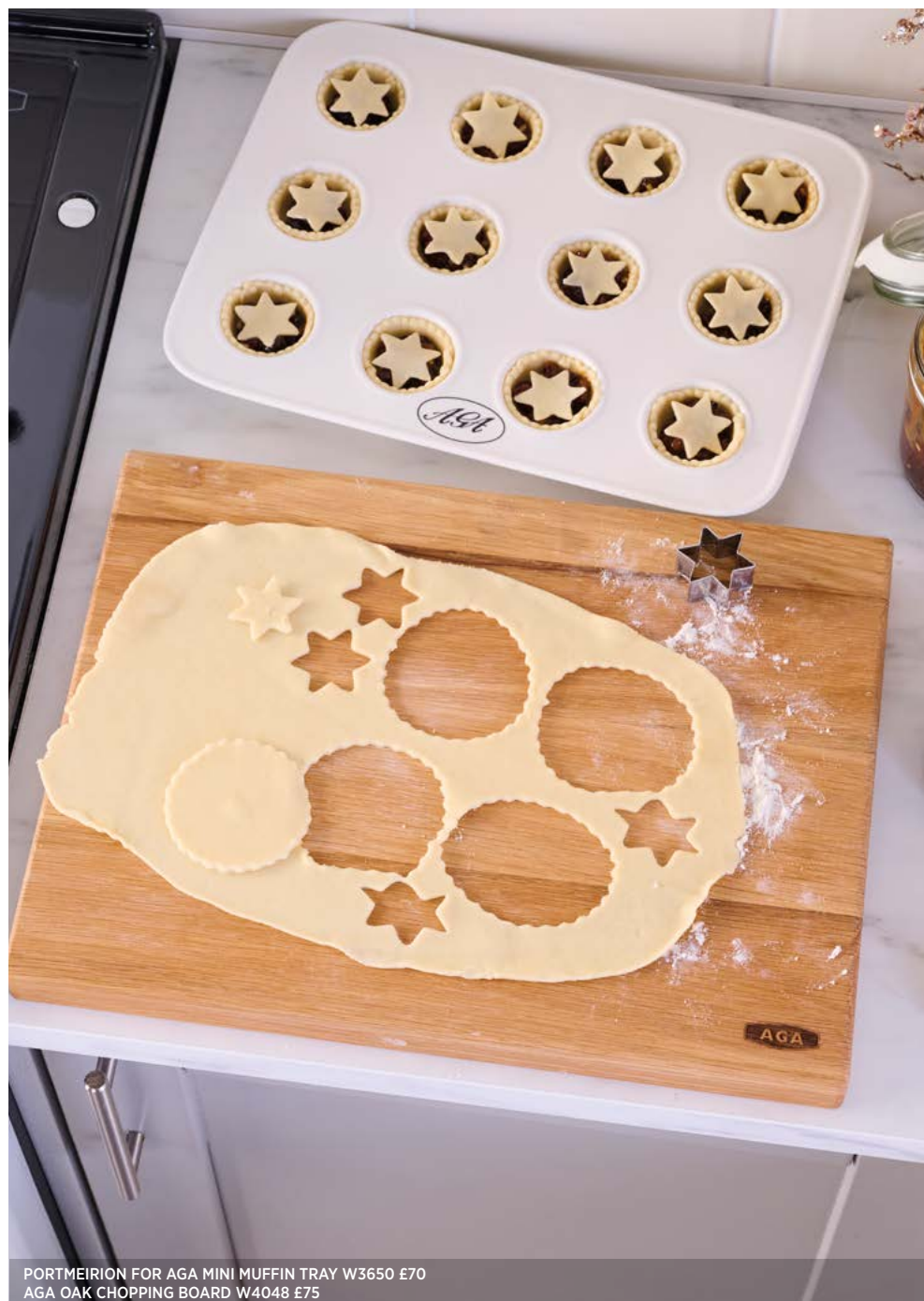
PORTMEIRION FOR AGA MINI MUFFIN TRAY W3650 £70 AGA OAK CHOPPING BOARD W4048 £75