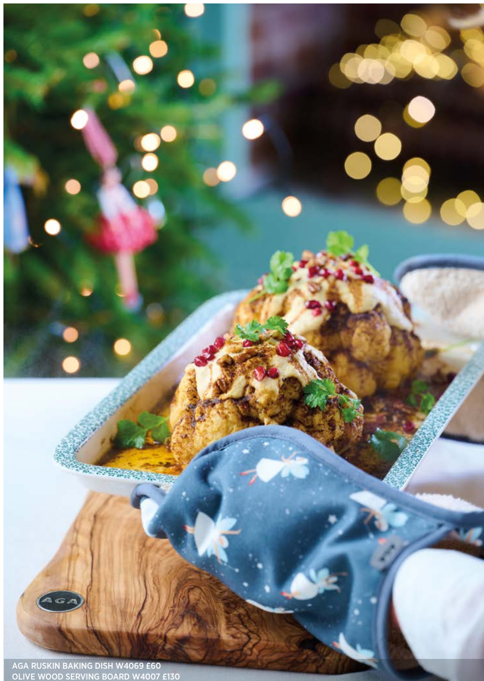
AGA RUSKIN BAKING DISH W4069 £60 OLIVE WOOD SERVING BOARD W4007 £130