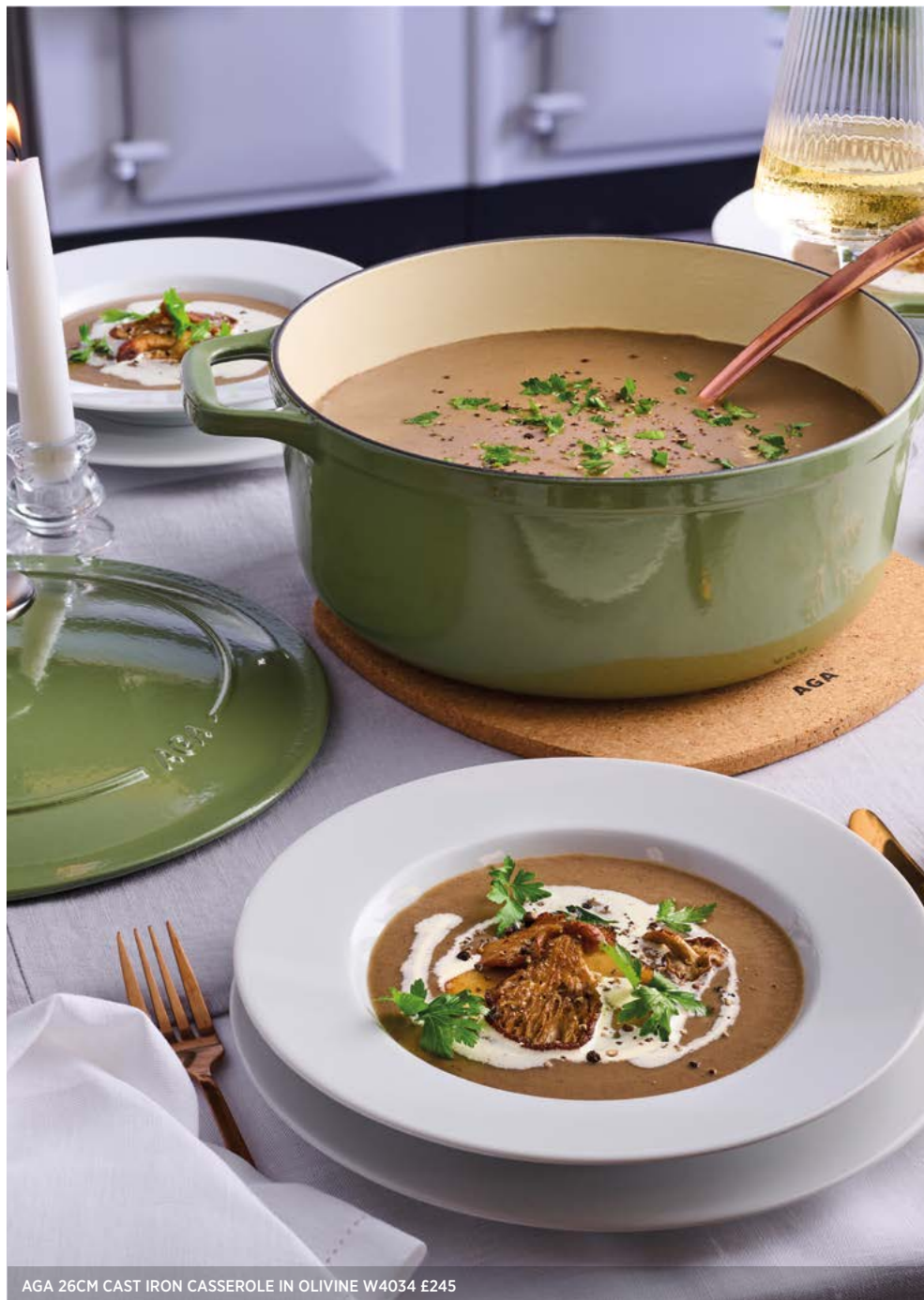
AGA 26CM CAST IRON CASSEROLE IN OLIVINE W4034 E245